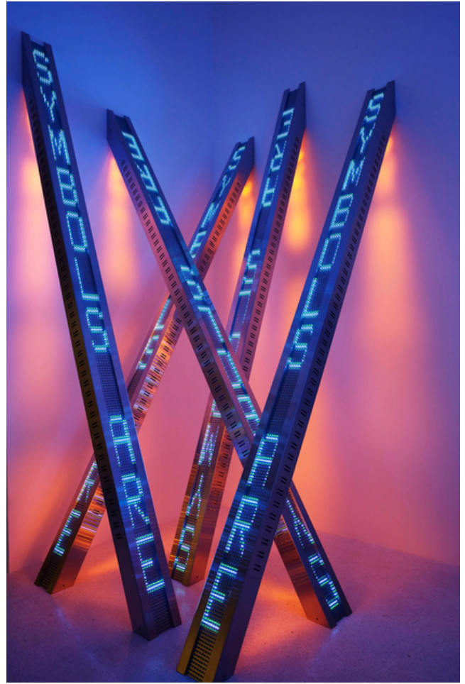
JENNY HOLZER , All Fall , 2012, 28 LED signs with blue, green, red and white diodes, dimensions variable. Copyright the artist, Courtesy Pearl Lam Galleries.