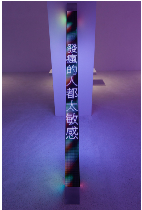
JENNY HOLZER , Inclined , 2013, LED sign with blue, green and red diodes, 243.8 × 15.2 × 15.2 cm.

Jenny Holzer: Light Stream is on view at Pearl Lam Galleries in Hong Kong, from September 19–November 2, 2013.