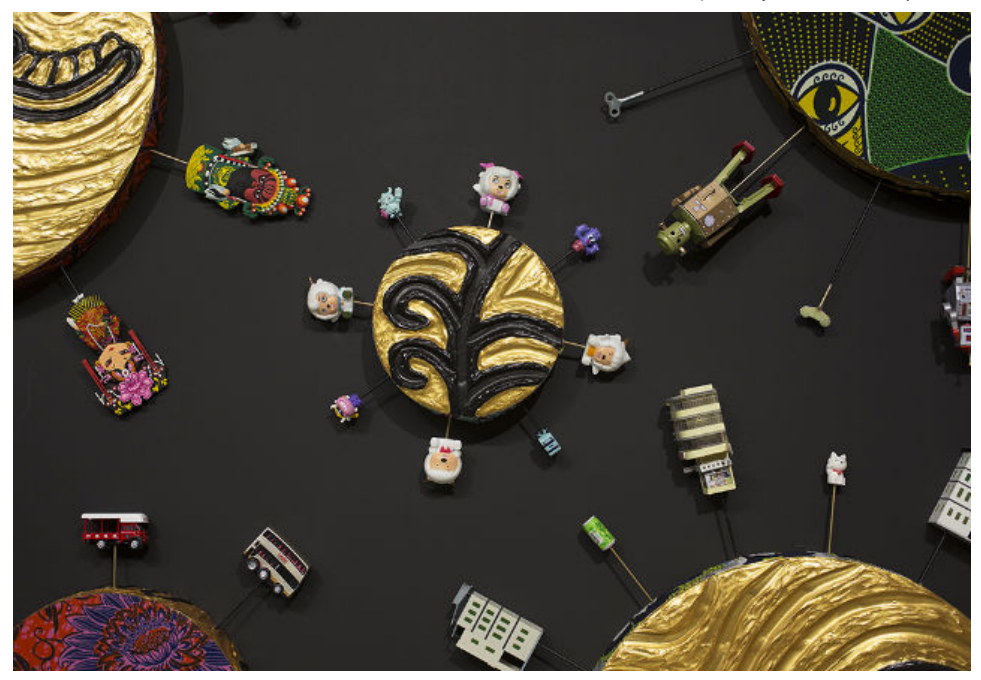
Yinka Shonibare, "Hong Kong Toy Painting"

Five new large-scale collage works are also on show. Shonibare's research team extensively interviewed Hong Kong's homeless for the creation of these works, asking "What would you do if you had more money?" The responses are included in the collage work as written text scrawled over clippings from the Financial Times, batik fabric flowers, luxury magazine covers, gold leaf, and images of Hong Kong's skyscrapers, creating a poignant juxtaposition of the worlds of wealth and of poverty.