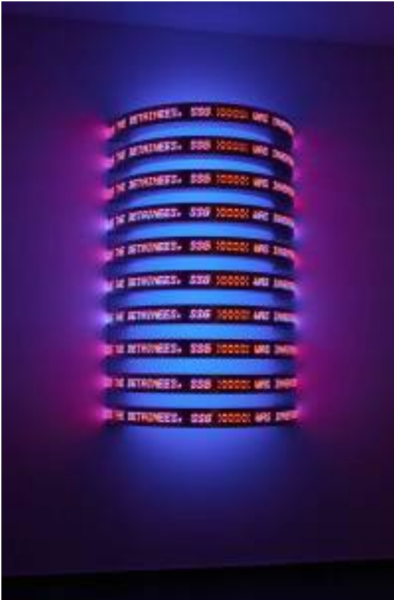
Jenny Holzer "Torso" (2007)

American artist Jenny Holzer will debut in Hong Kong a major new bilingual installation that she describes as an “electronic wilderness.”