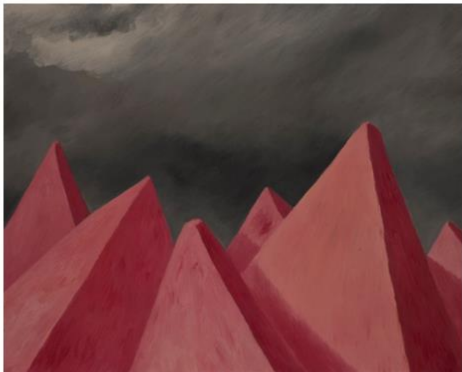
Yan Bing, "Watermelon Red", oil on canvas, 80×100cm, 2012, Gallery Yang, 闫冰,《西瓜红》,布面油画,80×100cm,2012,杨画廊