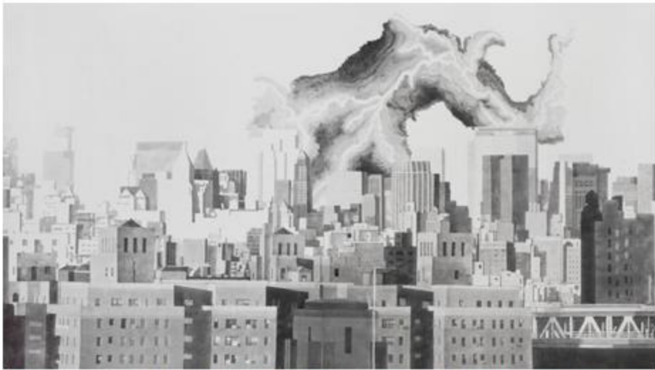
Ye Linghan, "50% Dollar 001", Watercolour on Paper, 190×110cm, 2013, Gallery Yang 叶凌翰，《50%美金 001》，纸本水彩，190×110cm，2013，杨画廊