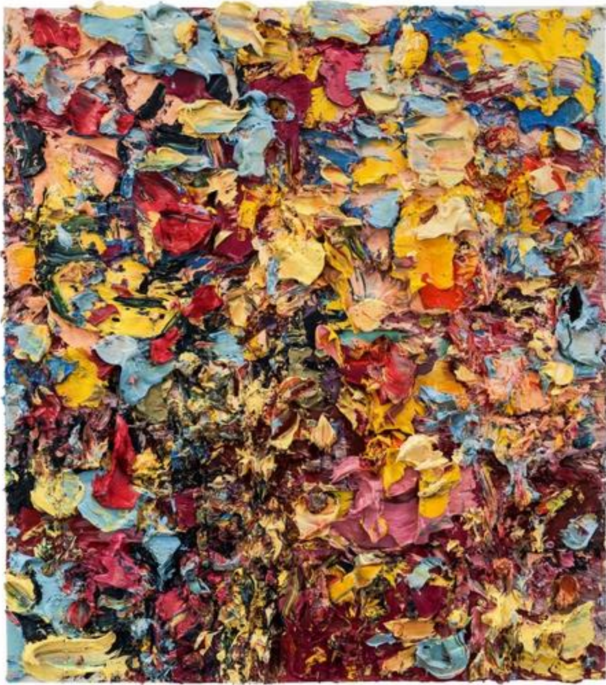
Zhu Jinshi, "The Song of Lhasa 3", Oil on canvas, 70 9/10 x 63 in, 2013, Pearl Lam, 朱金石, 《拉薩之歌三》, 布面油畫, 180 x 160 cm, 2013, 艺术门