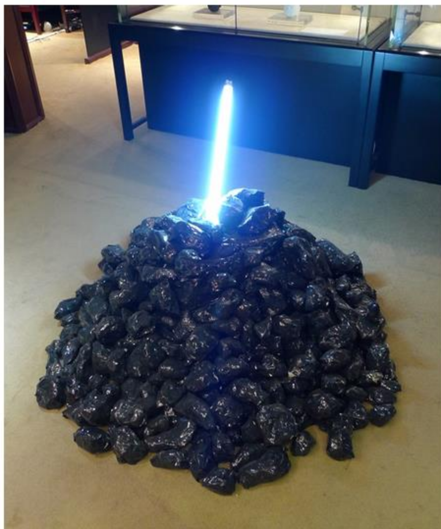
Liao Fei, "About Matter No. 11", tape, paper, fluorescent tubes, wires, 140×130×120cm, 2012, Vanguard Gallery

廖斐，《关于物质No.11》胶带、纸、荧光灯管、电线，140×130×120cm，2012， Vanguard画廊