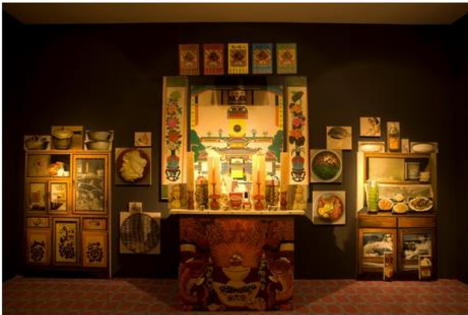
Dong Yuan, "Grandmother's House_ancestors' layer", oil and acrylic on canvas,