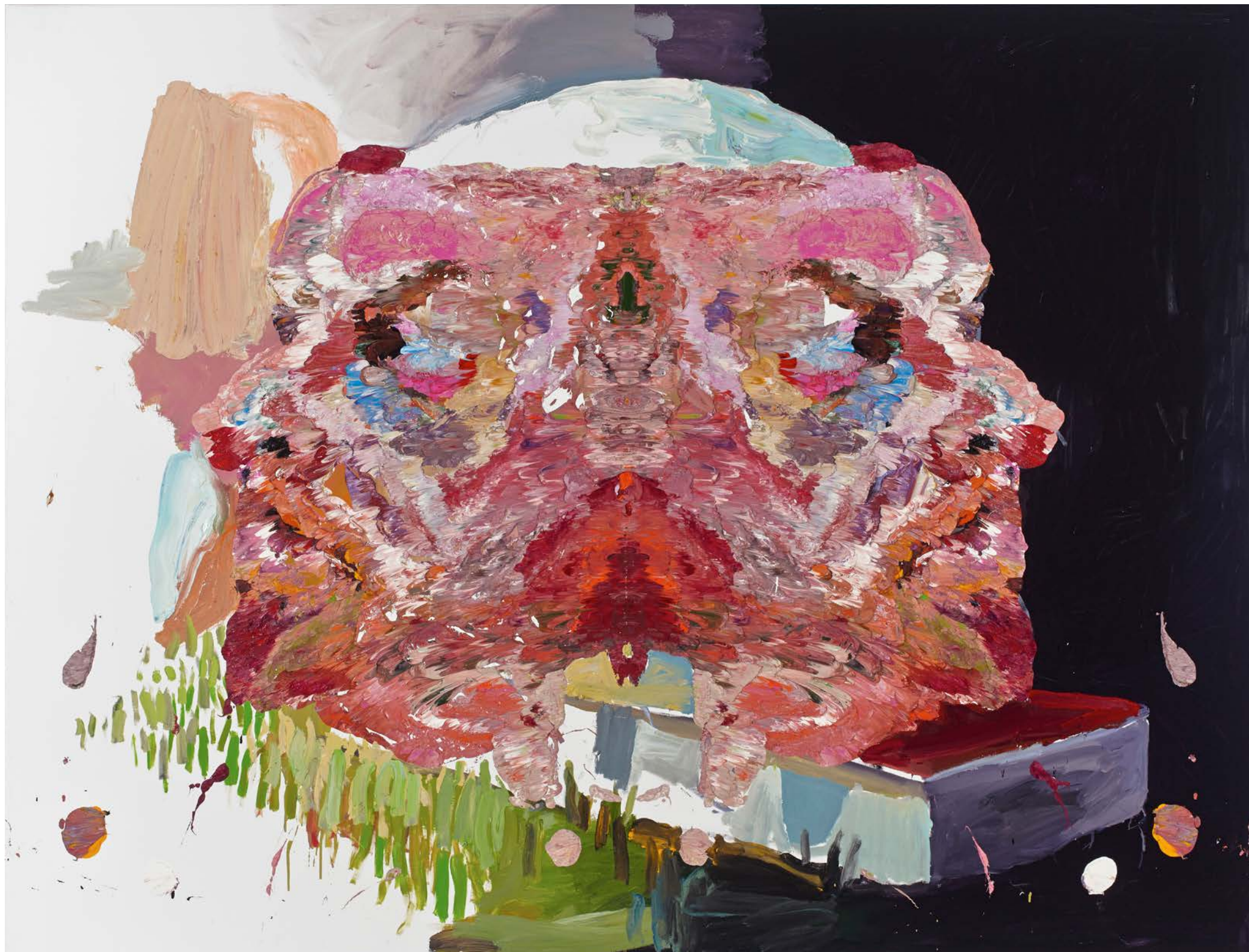
Andre at Jim Morrison's Grave 在吉姆·莫里森墓旁的安德烈, 2014 Oil on linen 亞麻布面油畫 202 x 265 cm (79 1/2 x 104 3/8 in.)