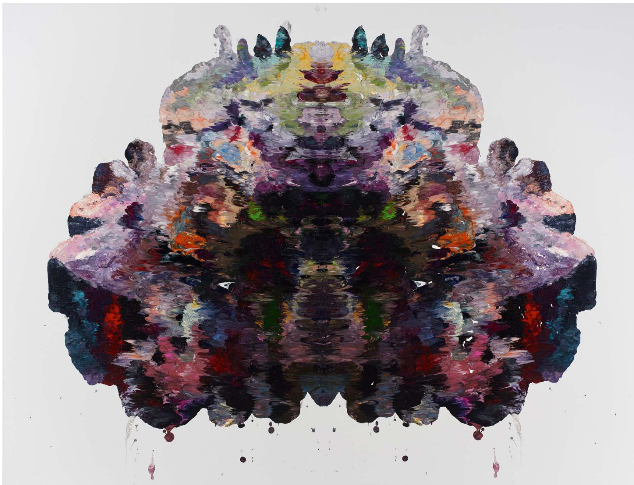
Homeland 故乡, 2014, Oil on linen 亞麻布面油畫, 202 x 265 cm (79 1/2 x 104 3/8 in.)