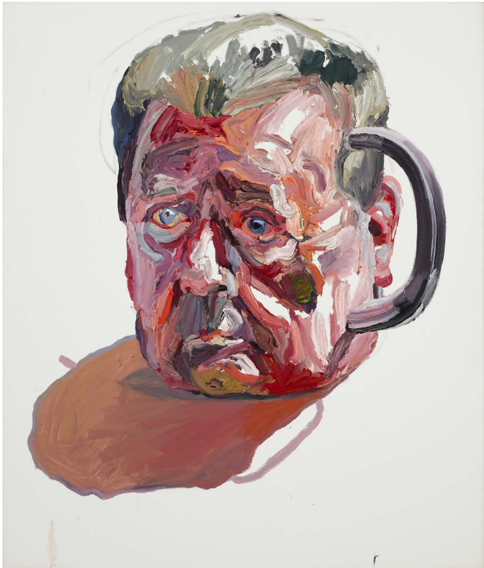
SWM Private Butler 白人直男二等兵巴特勒, 2014 Oil on linen 亞麻布面油畫 130 x 110 cm (51 1/4 x 43 3/8 in.)