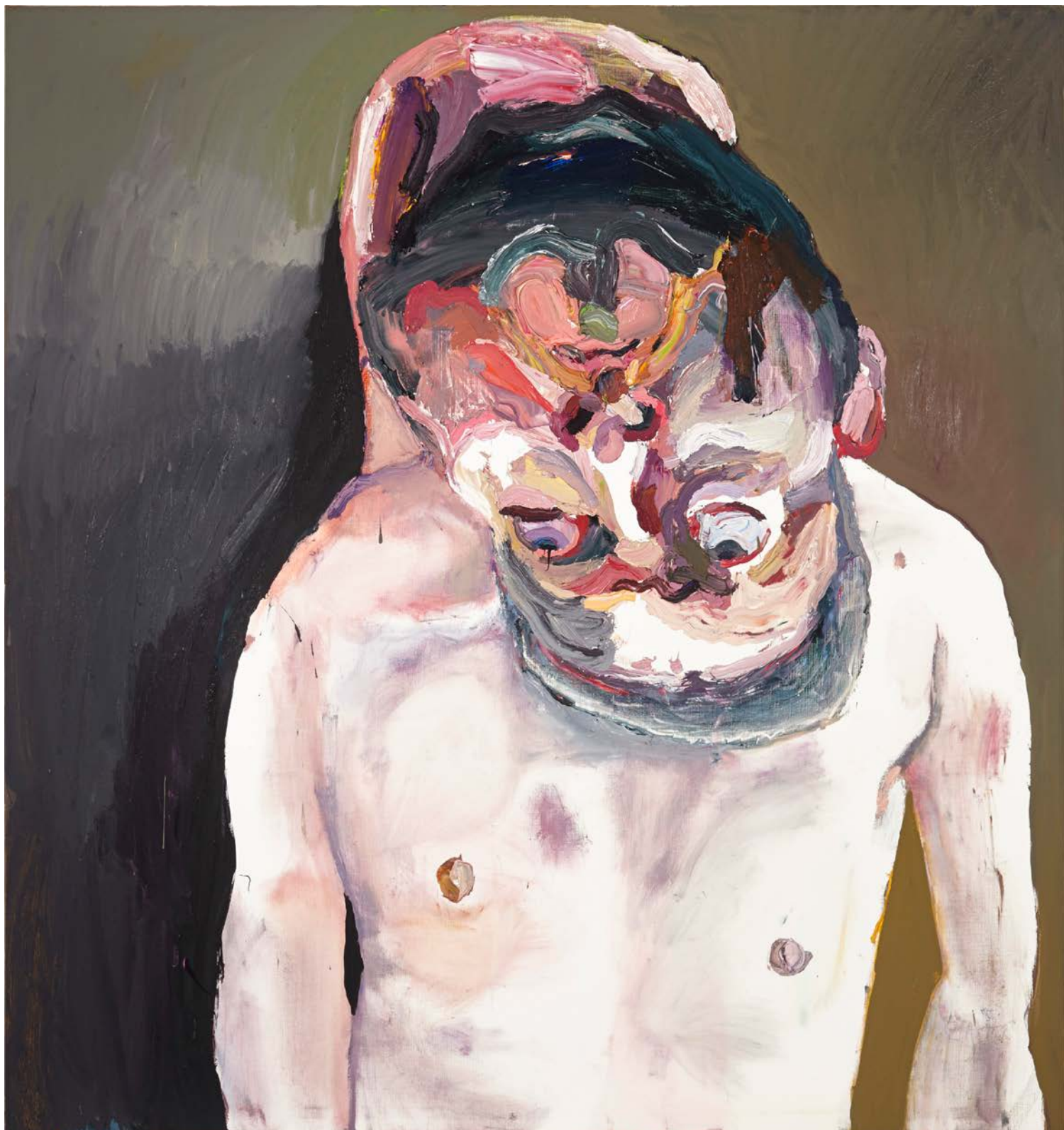
Straight White Male, Self-Portrait