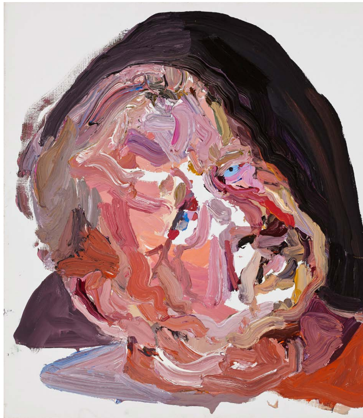
Private Phillip Butler, 7ARU, No. 2 二等兵菲利普·巴特勒, 7ARU, 二號, 2014 Oil on linen 亞麻布面油畫 80 x 70 cm (31 1/2 x 27 3/8 in.)