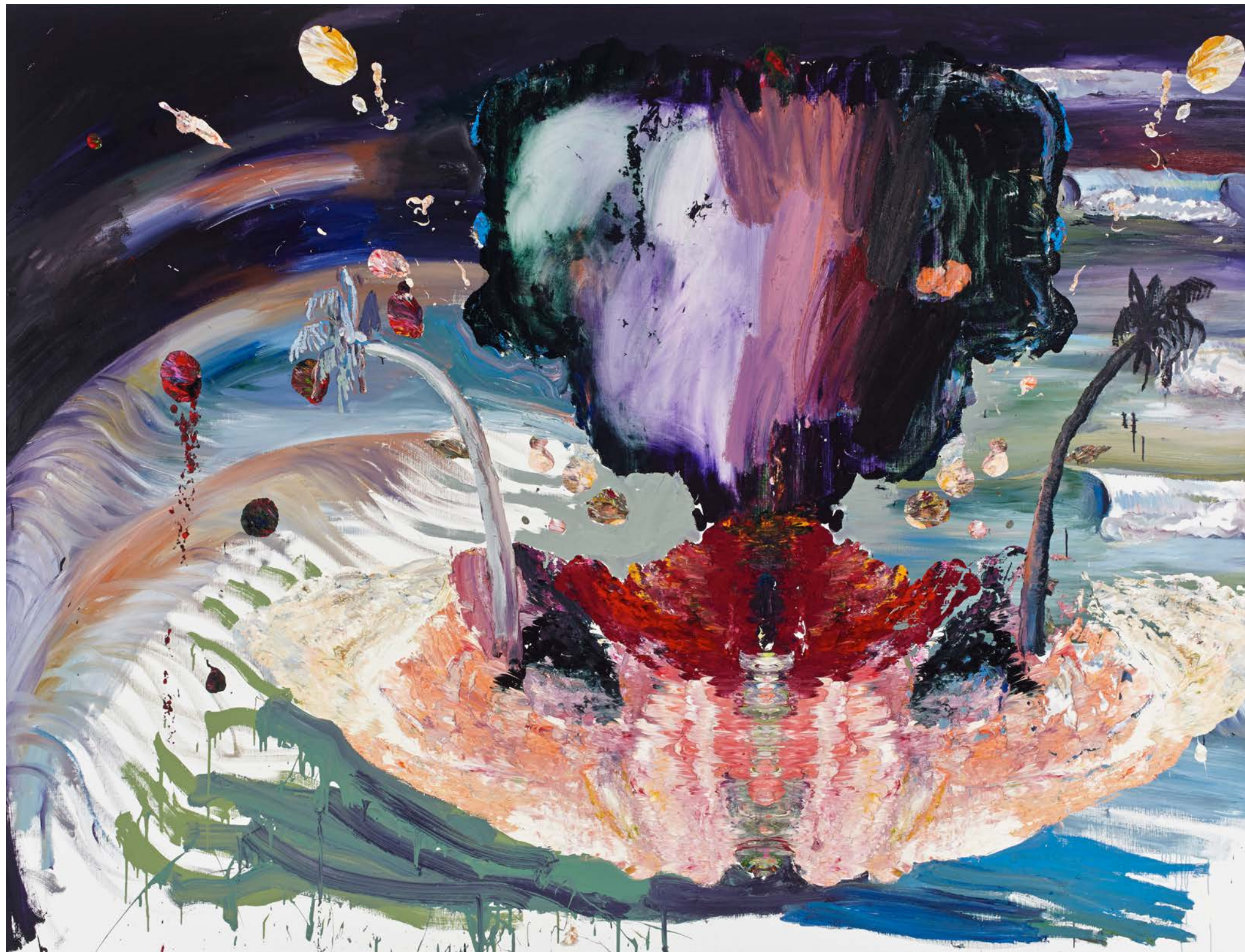
Utopia 烏托邦, 2014 Oil on linen 亞麻布面油畫 202 x 265 cm (79 1/2 x 104 3/8 in.)