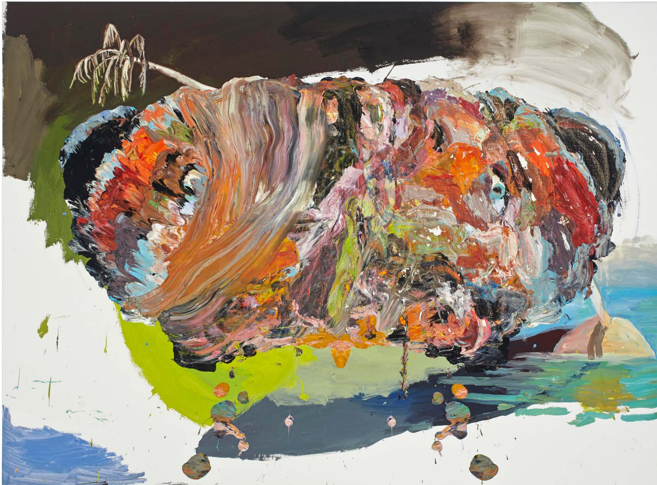
The Photojournalist (AQ) 攝影記者(安德魯·奎爾蒂), 2014 Oil on linen 亞麻布面油畫 140 x 190 cm (55 1/8 x 74 7/8 in.)