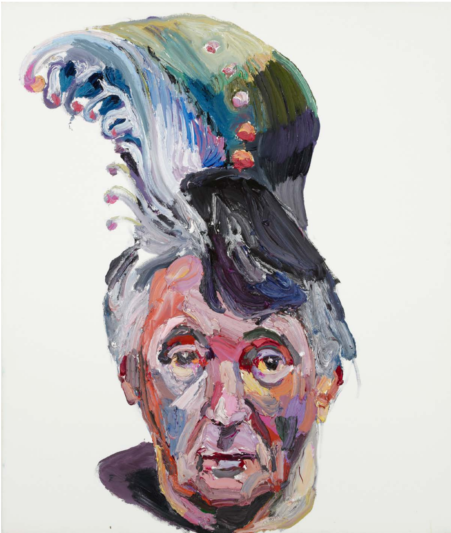
Dad with peacock hair 梳著孔雀冠髮型的父親, 2013 Oil on linen 亞麻布面油畫 135 x 115 cm (53 1/8 x 45 1/4 in.)