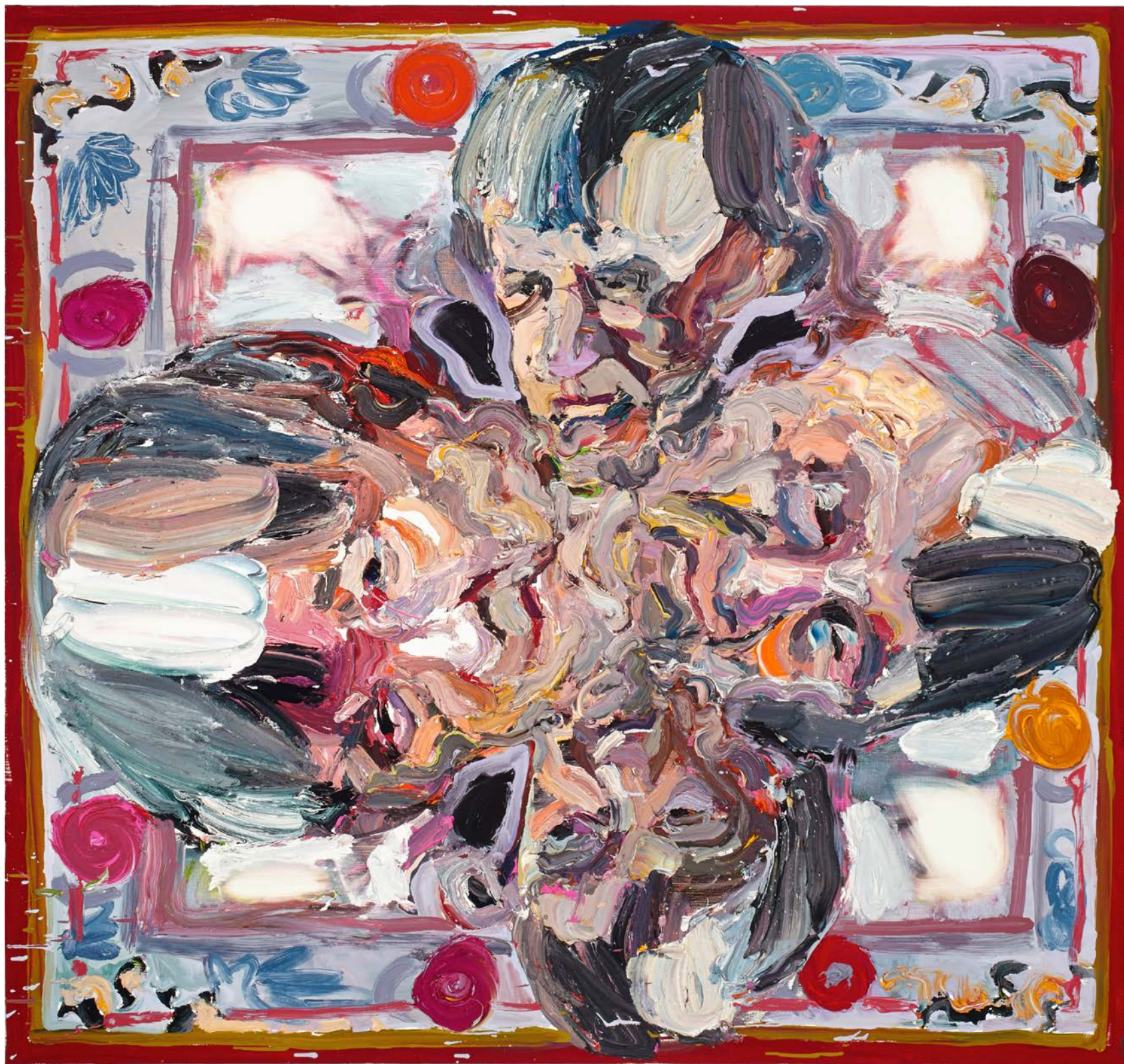
Painting for a rug about my Dad 有關父親的地毯的繪畫, 2014 Oil on linen 亞麻布面油畫 160 x 170 cm (63 x 67 in.)