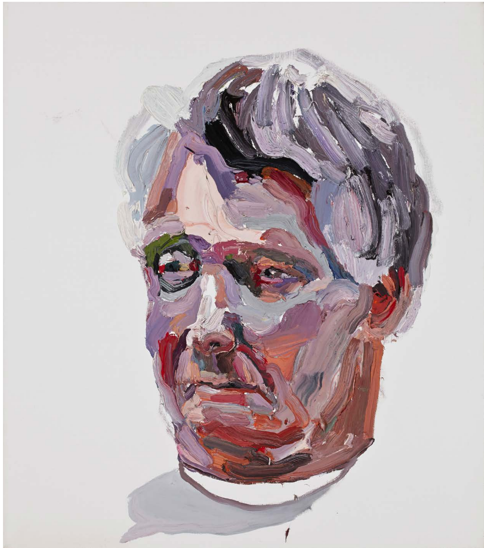
Straight White Male, Dad 白人直男, 父親, 2014 Oil on linen 亞麻布面油畫 80 x 70 cm (31 1/2 x 27 3/8 in.)