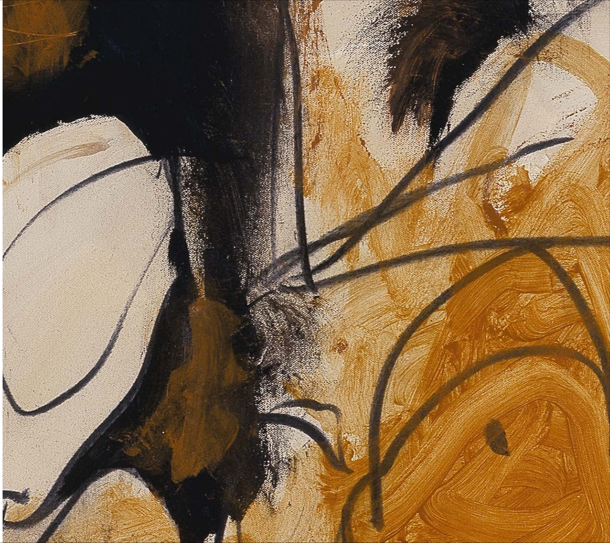
In the Studio (detail) 工作室內 (局部), 1984/ca. 1985 Acrylic and charcoal on canvas 布面丙烯、碳筆 61 x 91.5 cm (24 x 36 in.)