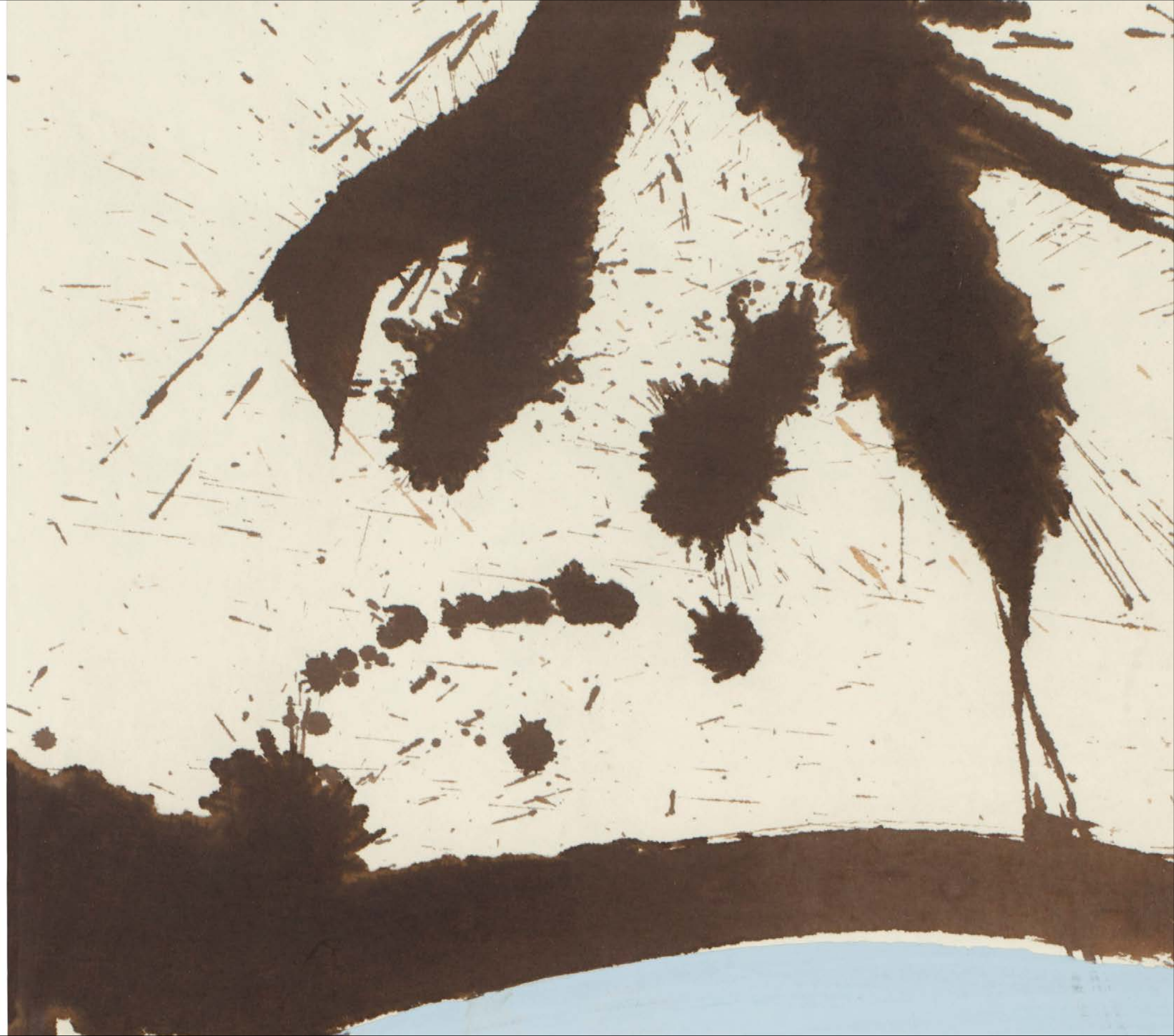
Automatism No. 11 (detail) 自動主義11號 (局部), 1965 Ink and oil on paper 紙本水墨油畫 67.5 x 61.5 cm (26 1/2 x 24 1/4 in.)