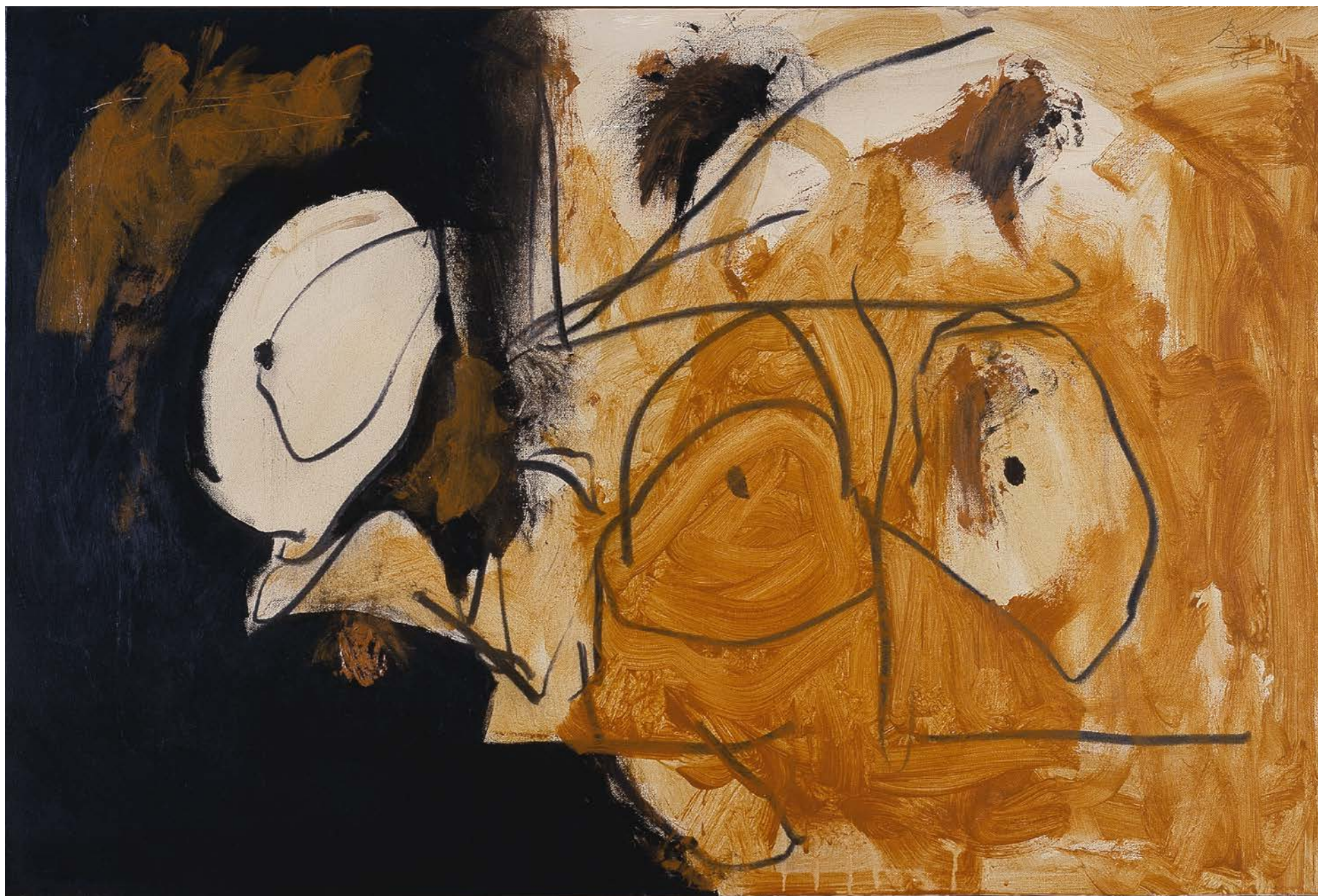
In the Studio 工作室內, 1984/ca. 1985, Acrylic and charcoal on canvas 布面丙烯、碳筆, 61 x 91.5 cm (24 x 36 in.)

Exhibited: Solomon R. Guggenheim Museum, Robert Motherwell , New York, 1984; Galeria Joan Prats, Robert Motherwell , Barcelona, 1986, later travelled to Palau Solleric, Palma de Mallorca; Museo de Bellas Artes