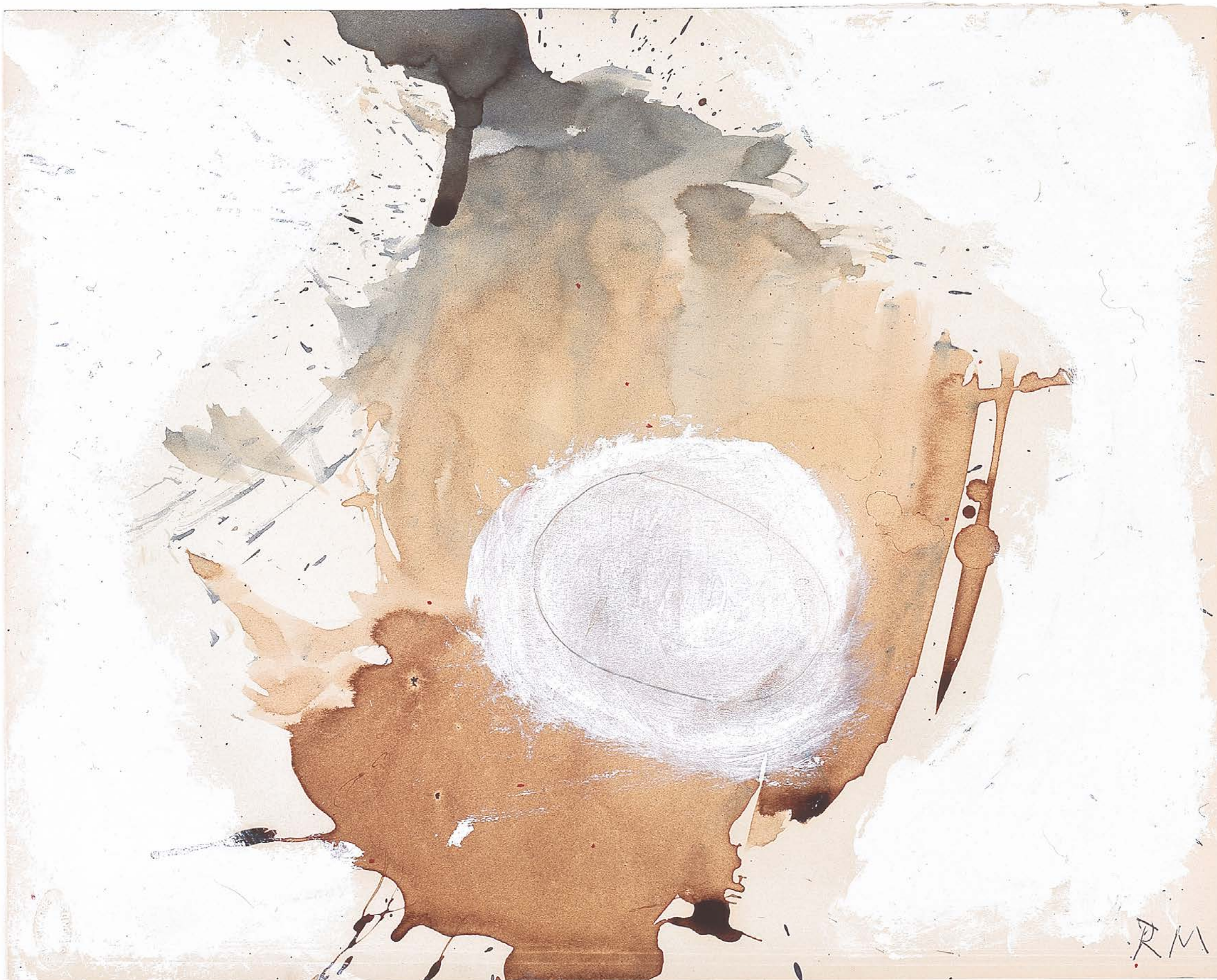
Untitled 無題, 1957 Ink and oil on rag paper 布漿紙、水墨、油彩 28.5 x 36 cm (11 1/4 x 14 1/4 in.)

Exhibited: VI Bienal of Museum of Modern Art Sao Paulo, 1961 (proprietor Museum of Modern Art, New York)