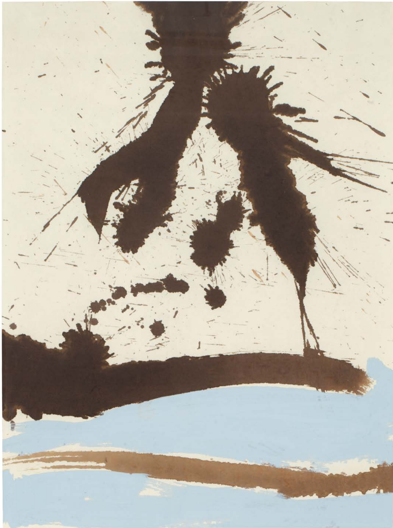
Automatism No. 11 自動主義11號, 1965 Ink and oil on paper 紙本水墨油畫 67.5 x 61.5 cm (26 1/2 x 24 1/4 in.)