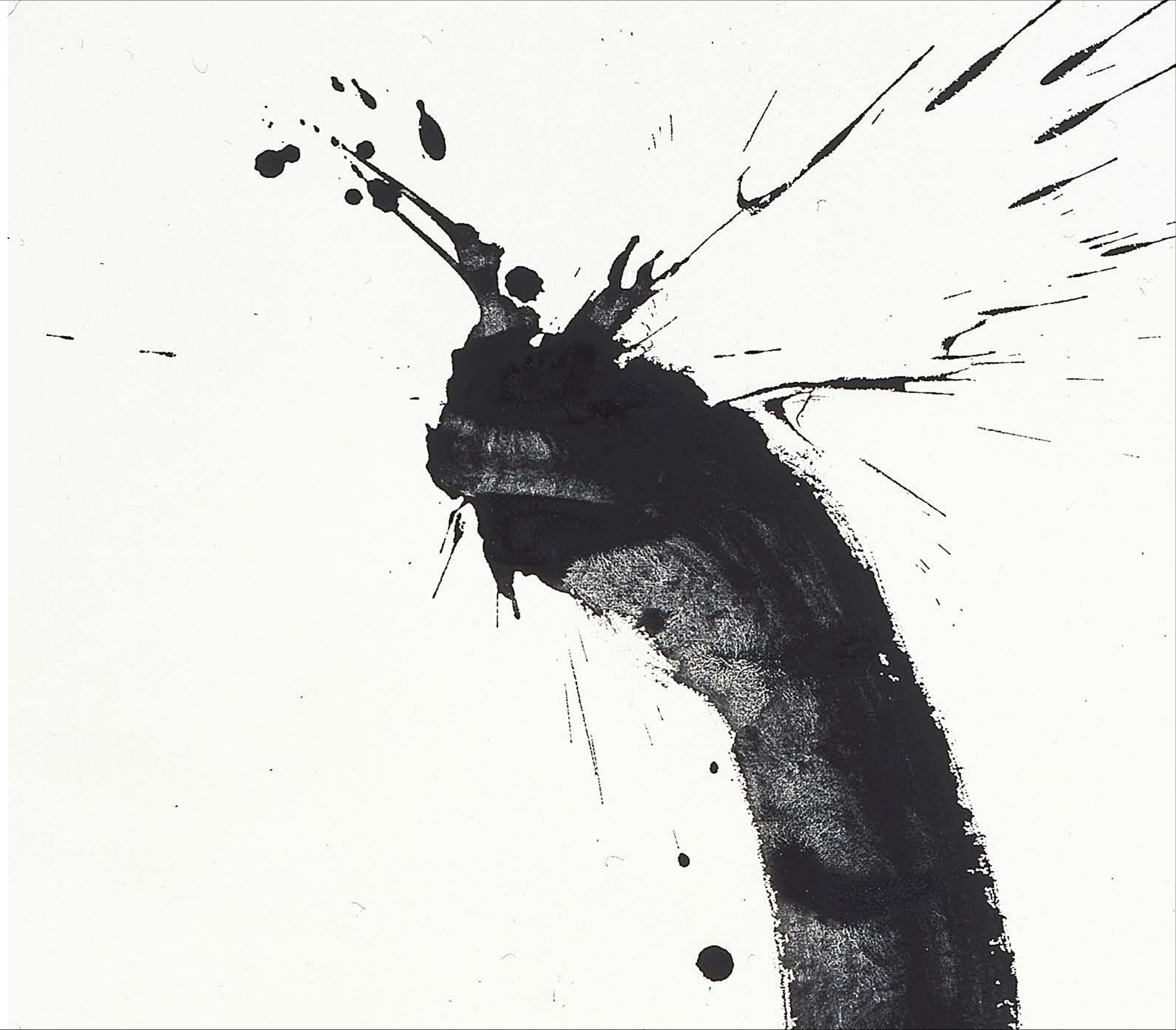
Gesture Series (A) (detail) 姿態系列-A (局部), 1969 Acrylic on paper 紙本丙烯 77.5 x 57 cm (30 1/2 x 22 1/2 in.)