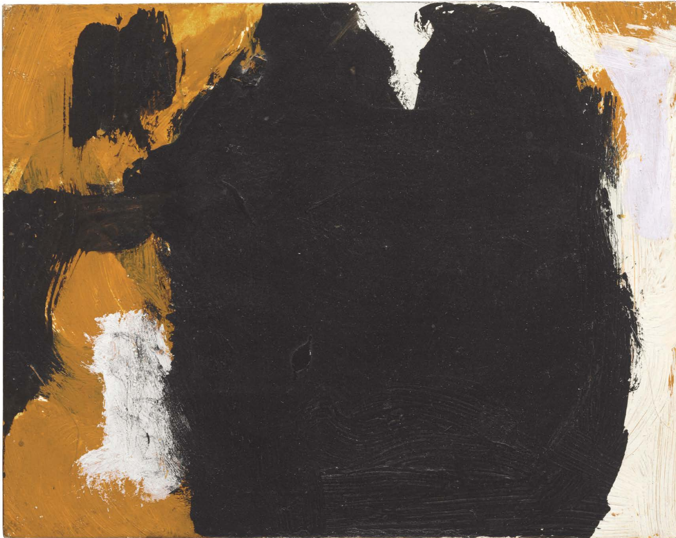
Two Figures No. 7 兩人7號 , 1958 Oil on paperboard mounted on board 裝裱在木板上的紙板油畫 19 x 21.5 cm (7 1/2 x 8 1/2 in.)

Exhibited: Sidney Janis Gallery, New York, Robert Motherwell , 1959