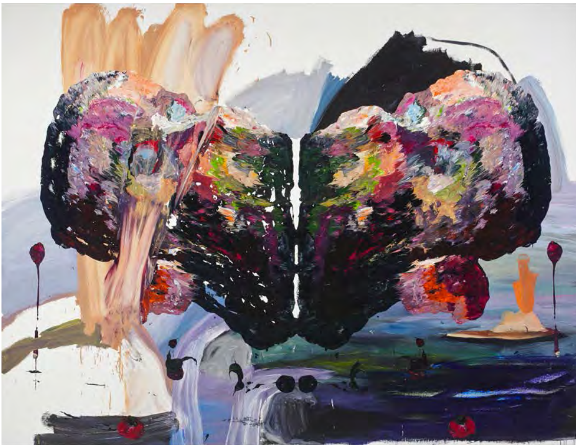
Ben Quilty b. 1973, Self with Orange Plants 自畫與橙樹, 2014, Oil on linen 亞麻布面油畫, 202 x 265 cm (79 1/2 x 104 1/3 in.)