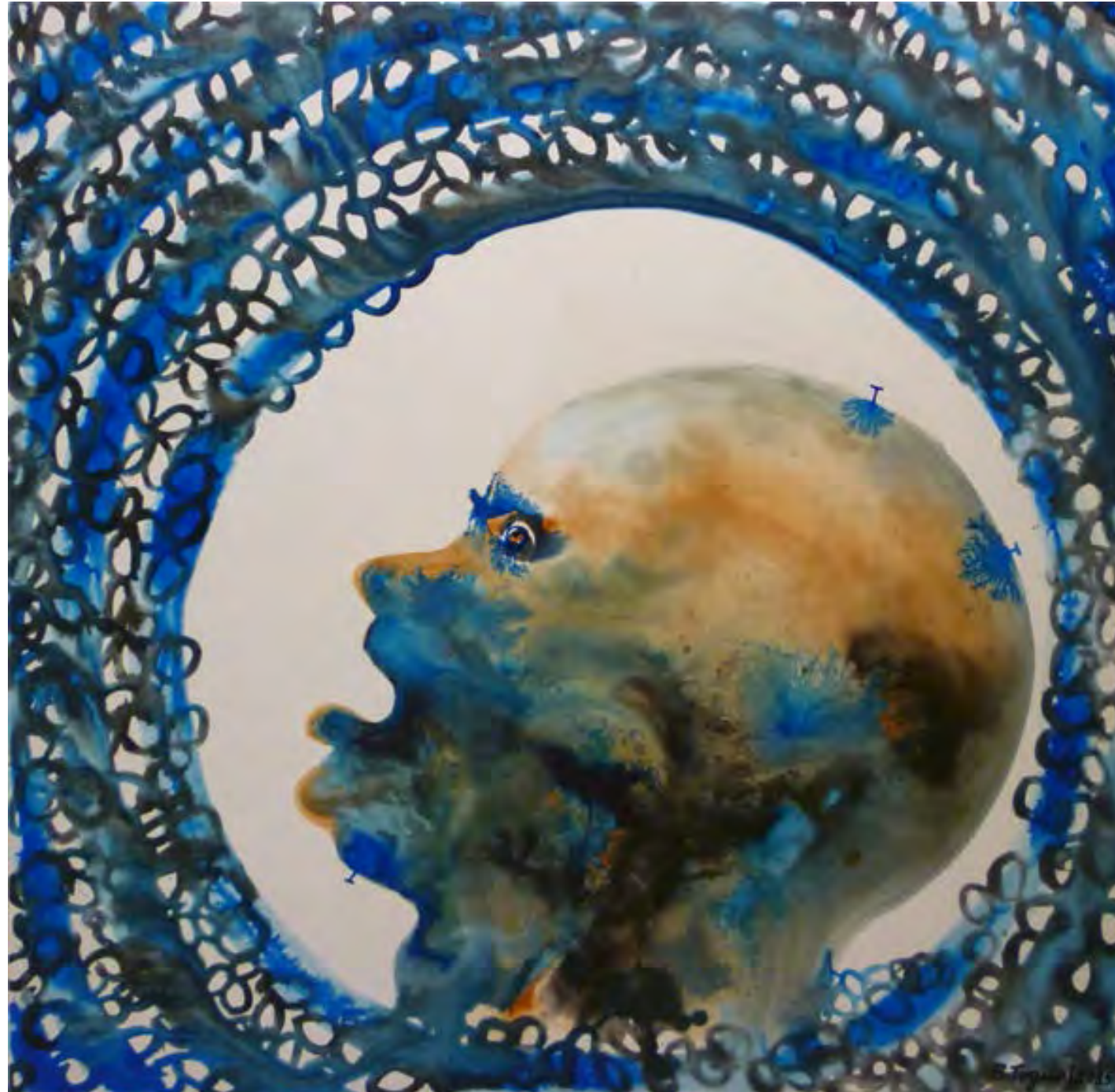
Barthélémy Toguo b. 1967, Walking in circles 圓中徒步, 2015, Ink on canvas 布面水墨, 100 x 100 cm (39 1/2 x 39 1/2 in.)