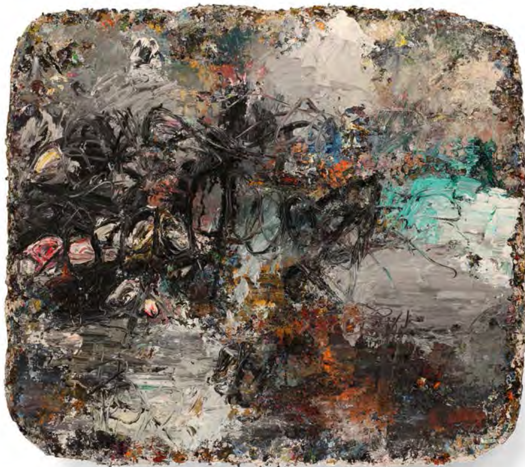
Su Dong Ping 蘇東平 b. 1958, 2014No.17 , 2014, Oil and mixed media on canvas 布面油畫及綜合材料, 152 x 182 cm (59 9/10 x 71 7/10 in.)