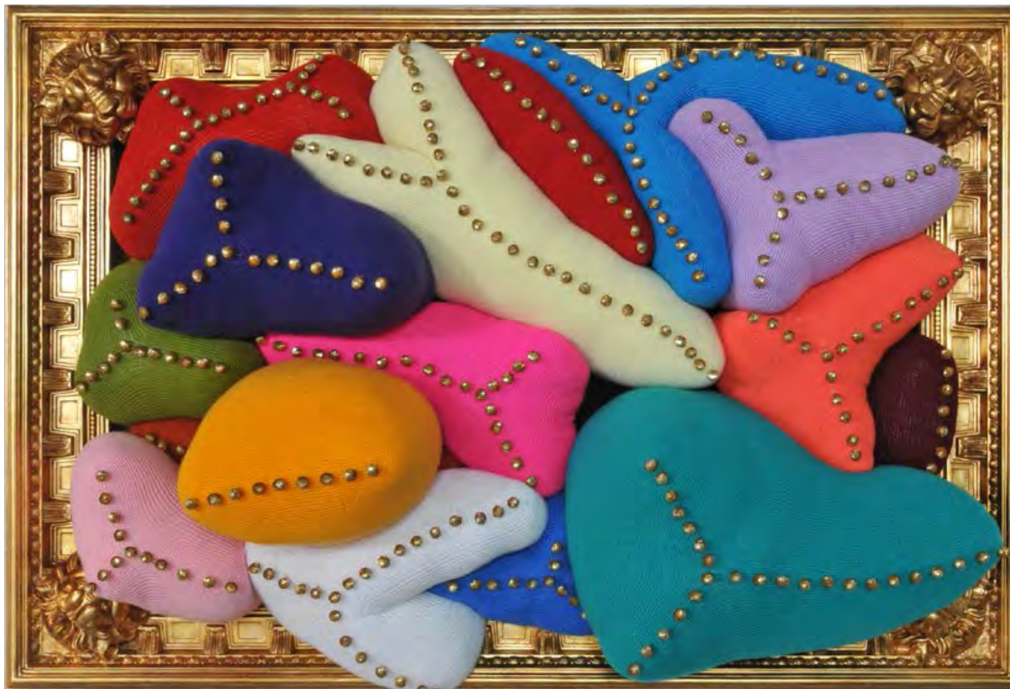
Joana Vasconcelos b. 1971, Majestic Lion 雄偉的獅子, 2014

Handmade woolen crochet, ornaments, polyester on canvas, stucco, gold leaf, MDF and iron 手工羊毛鉤針編織、首飾、油畫布、灰泥、金箔、中密度纖維板、鐵, 149 x 219 x 50 cm (59 x 86 x 20 in.)