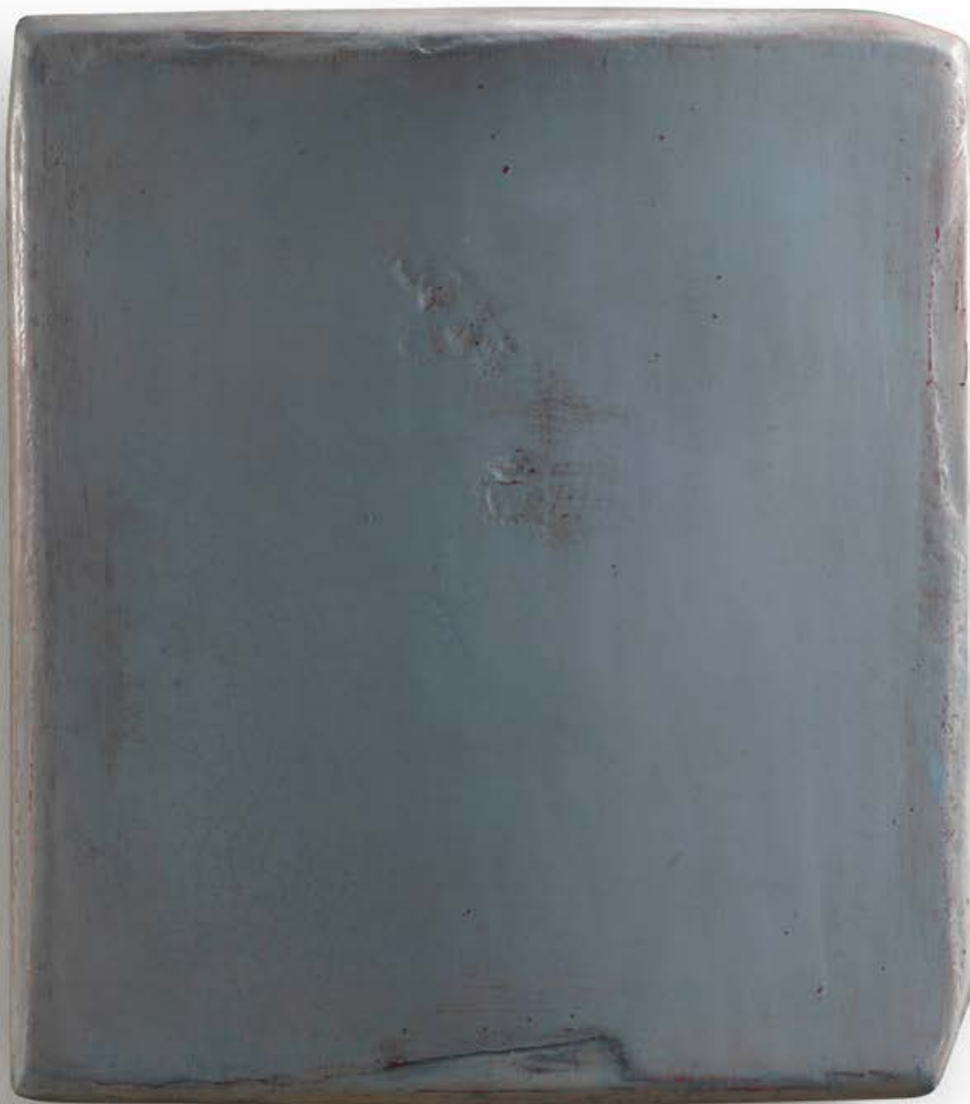
Su Xiaobai 苏笑柏 b. 1949 Big Tile Kiln No. 9 大瓦窑-9 , 2014 Oil, lacquer, linen and wood 油彩、漆、麻、木 77 x 70 x 9 cm (30 1/3 x 27 1/2 x 3 1/2 cm)