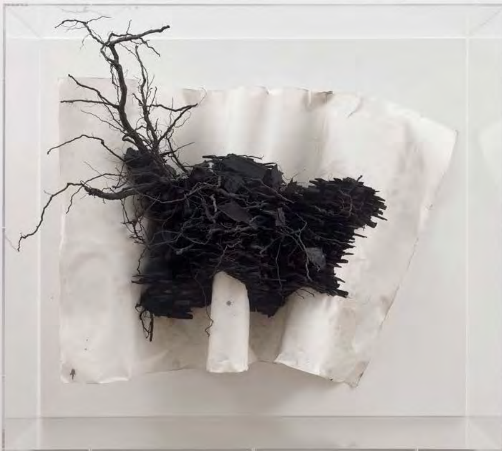
Leonardo Drew b. 1961, Number 135D 數字 135D, 2012, Wood, paint on paper in plexiglass box 木、紙上顏料、壓克力盒, 101.6 x 114.3 x 48 cm (40 x 45 x 18 7/8 in.)