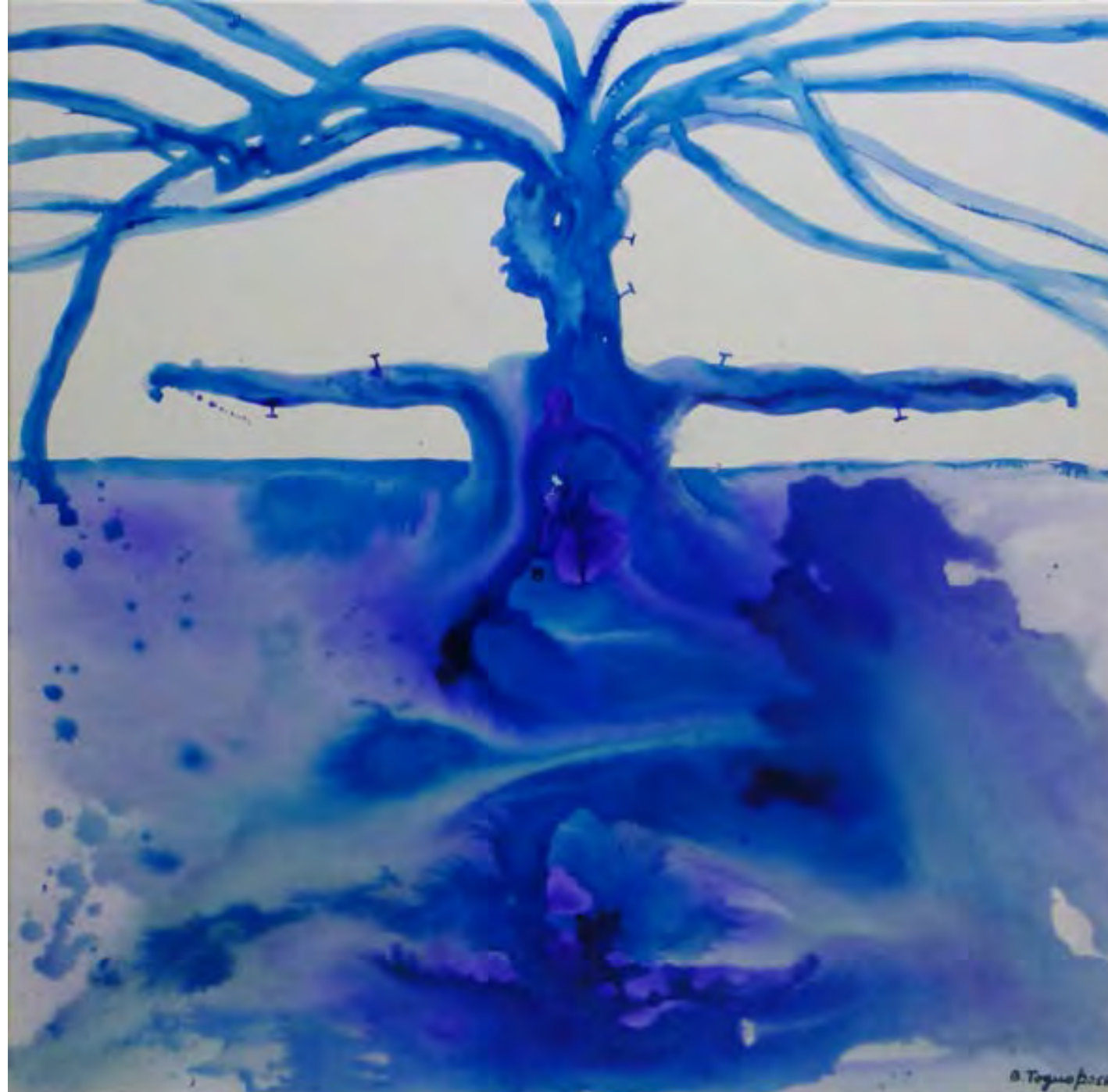
Barthélémy Toguo b. 1967, The Blue Man in the Sky 空中藍人, 2015, Ink on canvas 布面水墨, 100 x 100 cm (39 1/2 x 39 1/2 in.)