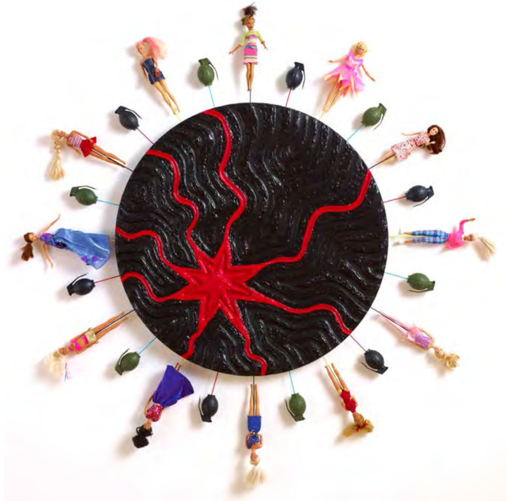
Yinka Shonibare MBE RA b. 1962, Barbie Painting 芭比繪畫, 2013, Acrylic paint on Dutch wax-printed cotton canvas, wires and toys 丙烯、荷蘭蠟印棉紡織品、鋼條和玩具, ø170 x 9 cm (ø67 x 3 1/2 in.)