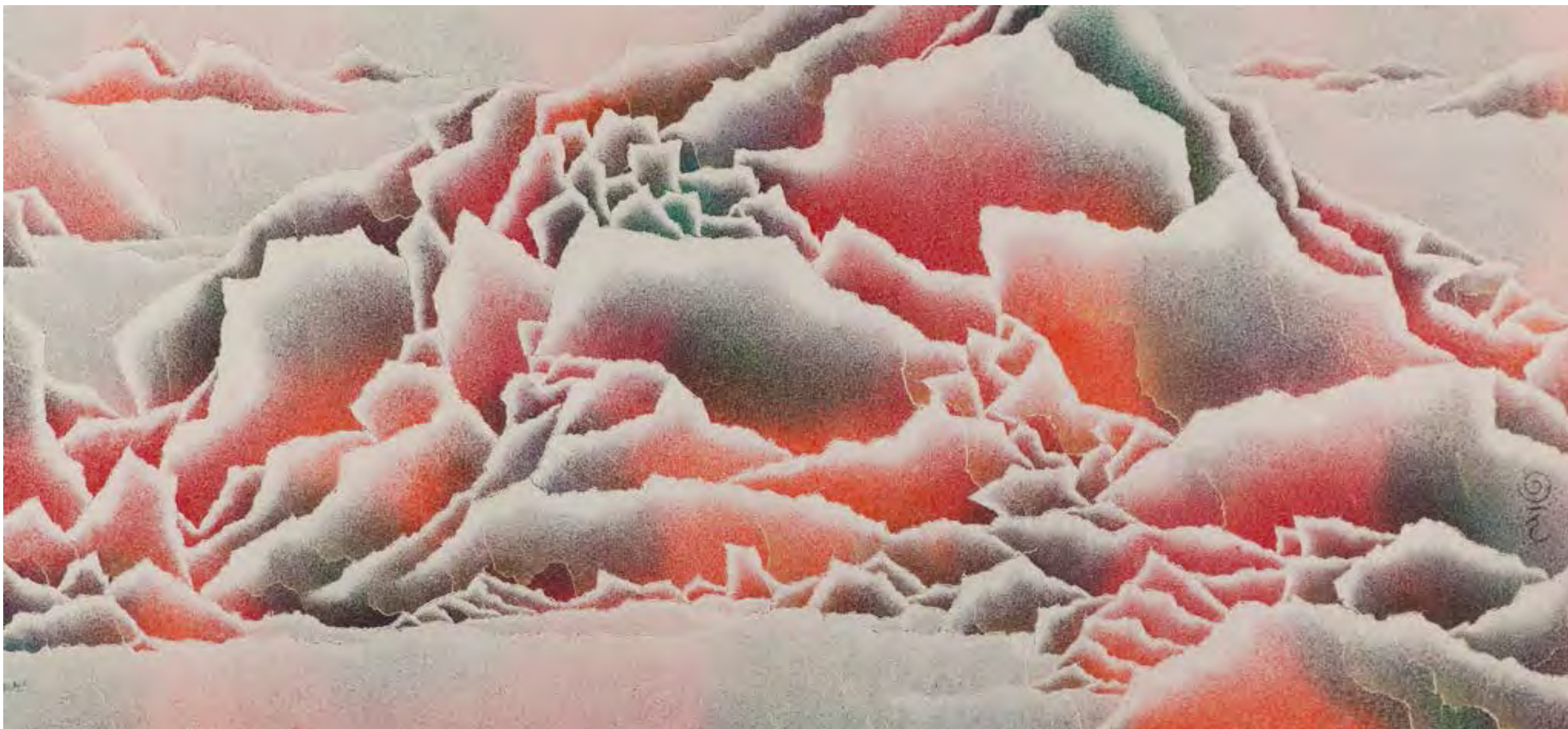
Qiu Deshu 仇德树 b. 1948, Fissuring—Landscape 裂变——山水, 2006–2007, Acrylic on Xuan paper and canvas 宣纸、丙烯色、画布, 97 x 212.5 cm (38 1/5 x 83 2/3 in.)