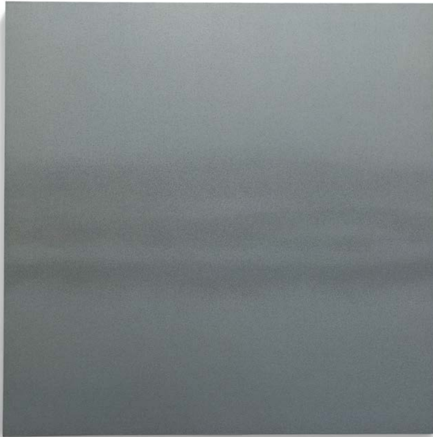
Jiang Dahai 江大海 b. 1946, Immense 茫, 2014, Acrylic on canvas 布面丙烯, 150 x 150 cm (59 x 59 in.)