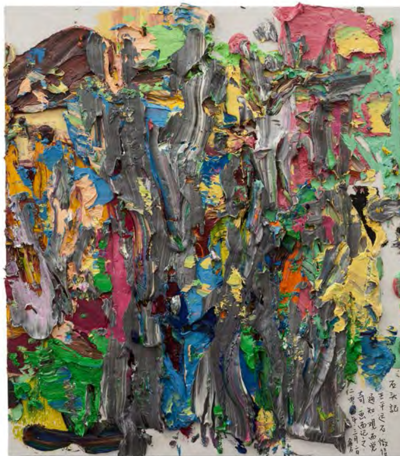
Zhu Jinshi 朱金石 b. 1954, Stone Story 石头记, 2014, Oil on canvas 布面油画, 180 x 160 cm (70 9/10 x 63 in.)