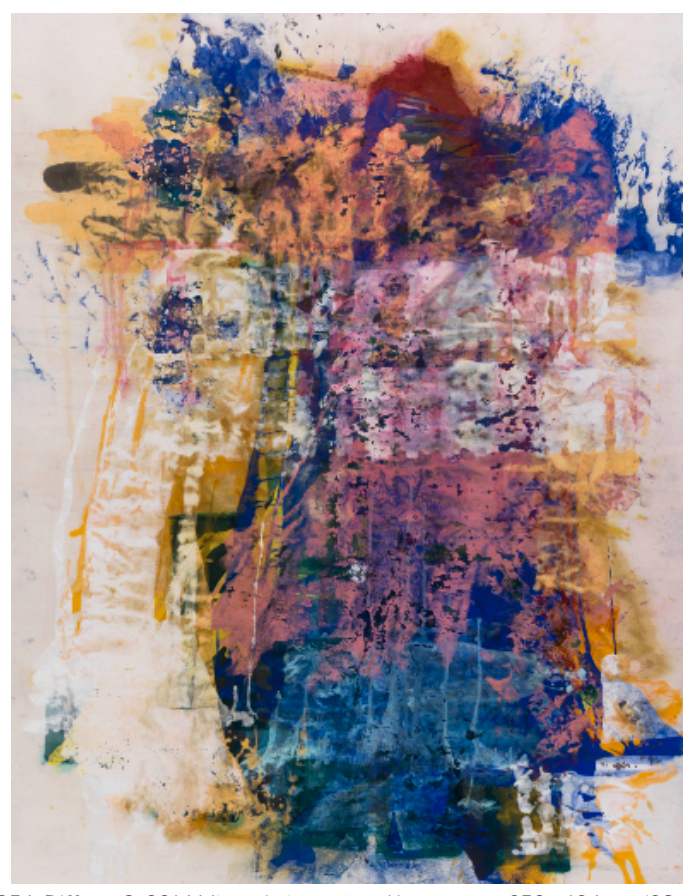
Qin Yufen b. 1954, Diffuse-2, 2014 Mineral pigment on Xuan paper, 250 x 194 cm (98 3/8 x 76 3/8 in.)

Cologne—Pearl Lam Galleries is pleased to announce its second participation in Art Cologne, at what will be the fair's historic 50th edition. Pearl Lam Galleries will be the only gallery from Asia to participate alongside 88 other galleries in the Contemporary Art section in Hall 11.2, and it will be one of only three Asian galleries across all sectors of the fair out of the 219 participating galleries. In addition to presenting 14 leading international contemporary artists in the Galleries sector, the Galleries will present three installations by Chinese artist Ma Yujiang in 'New Positions', a sector that highlights innovative young artists. Art Cologne will take place at Koelnmesse Hall 11.2 from 14–17 April. The vernissage will be on 13 April.