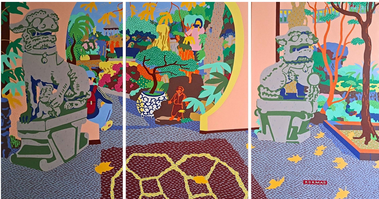
MICHAL KORMAN b. 1987, Slovakia (based in France), Garden of Delight , 2024, Oil on canvas Triptych, Each: 130 x 81 cm (51 1/8 x 31 7/8 in.); Overall: 130 x 243 cm (51 1/8 x 95 5/8 in.)

London—In the culminating exhibition of a year-long collaboration between Hong Kong and Shanghai-based Pearl Lam Galleries and Mayfair restaurant sketch, three brand-new paintings by Paris-based Slovakian artist Michal Korman will be showcased throughout the entrance hall of sketch from 9 January to 9 March. This partnership has provided a platform for artworks from the gallery's international roster to be shown in the UK, fostering cross-cultural exchange and underscoring how both food and art play a central role in creating memorable experiences and meaningful connections.